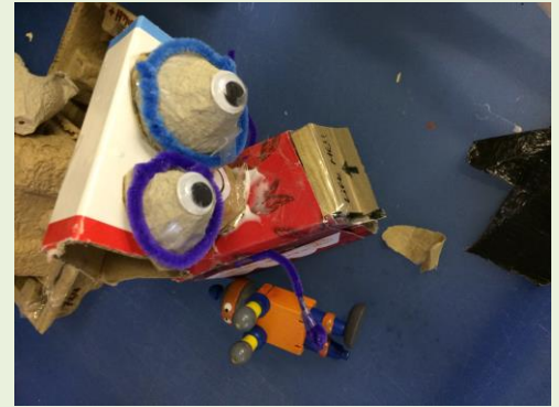
Wall-E Robots and Sandwiches

Book early to ensure your family's slot! Holiday club is also open to children from outside Shelford school aged 4-12 so please tell your friends that they are also welcome to book.